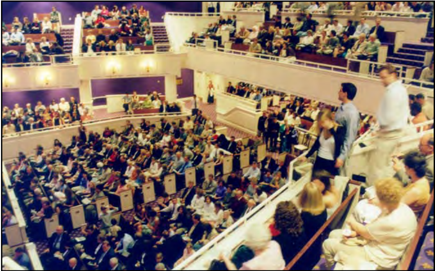
Leffler Chapel and Performance Center, opened in 1995, is home to lectures, concerts, religious services, classes, and - pictured here - the annual baccalaureate service held the evening before the 100th Commencement in May 2003.